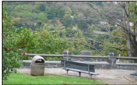
Views from Back of Property